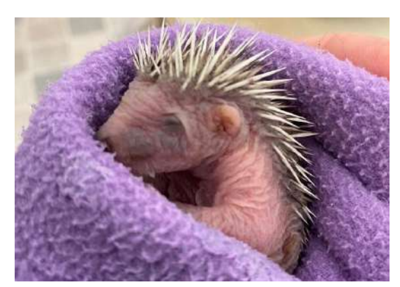
Of course, there is much more to tell, but this is sufficient for now!

We would, however, like to give heartfelt thanks to all our loyal supporters - even a word of encouragement boosts morale.