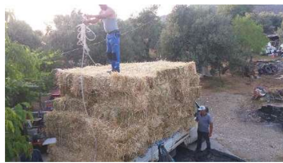
Delivery of Hay - same quantity of clover followed...

As happens every year, we have orphan kittens in our care who require bottle feeding. This is not easy and we would like to give a big thank you to our dedicated foster "parents" in Göcek. We neutered 375 cats in 2021 and 214 so far this year. However, despite our best efforts, it is very difficult to control the cat population.