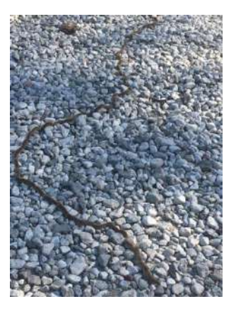
A caterpillar procession in the shelter

April was a very dry month and the spectre of life-threatening forest fires is once again with us. We have to be prepared for the worst-case scenario and be exceedingly vigilant. Naturally, our fire extinguishers require regular maintenance.