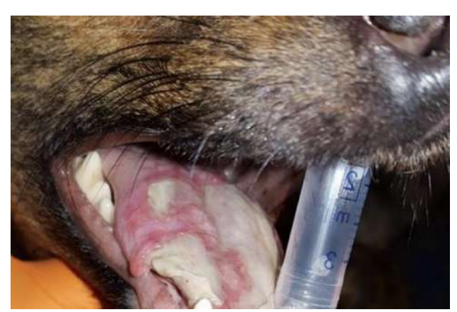
A damaged dog's mouth poisoned by caterpillars

At beginning of April the toxic processional caterpillar season commenced. Although traps are set, there are always incidents where dogs are poisoned and require medication.