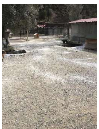
Sulphur and lime

In addition to seasonal challenges, the economic crises are having a detrimental effect on our finances. Dog food costs are €2400 every 20-22 days, with the price increasing every month.