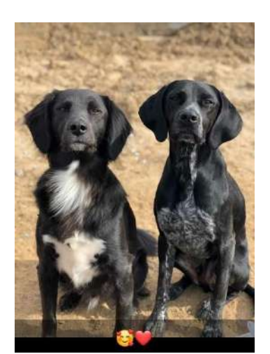
Emmenthal and Happy