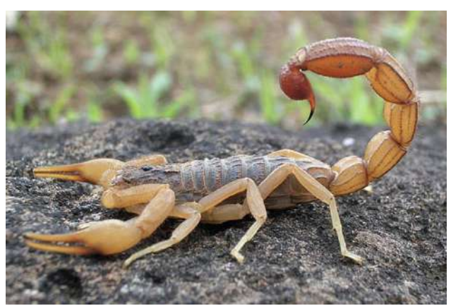
So many places for these deadly scorpions to hide