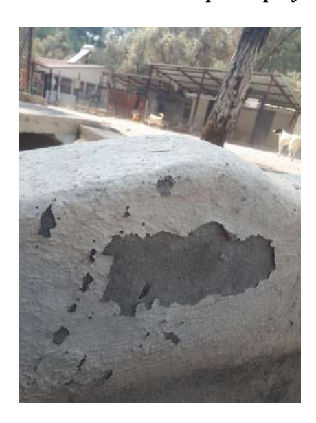
Scorching summers and freezing winters make everything deteriorate rapidly

A summer treat for the dogs is cooling off in our dog pool. They love playing in the water and as this summer is predicted to be a scorcher, any cracks in the concrete must be promptly repaired to prevent leaks.