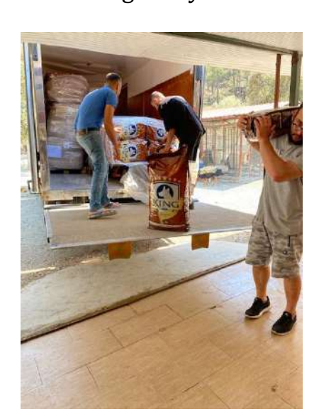
The food lorry is a regular visitor to the shelter

In addition to seasonal challenges, the economic crises are having a detrimental effect on our finances. Dog food costs are €2400 every 20-22 days, with the price increasing every month.